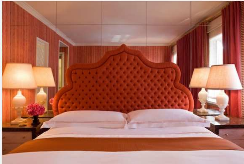
Rooms at the renovated Maison 140 in Beverly Hills now reflect a classic Parisian style.