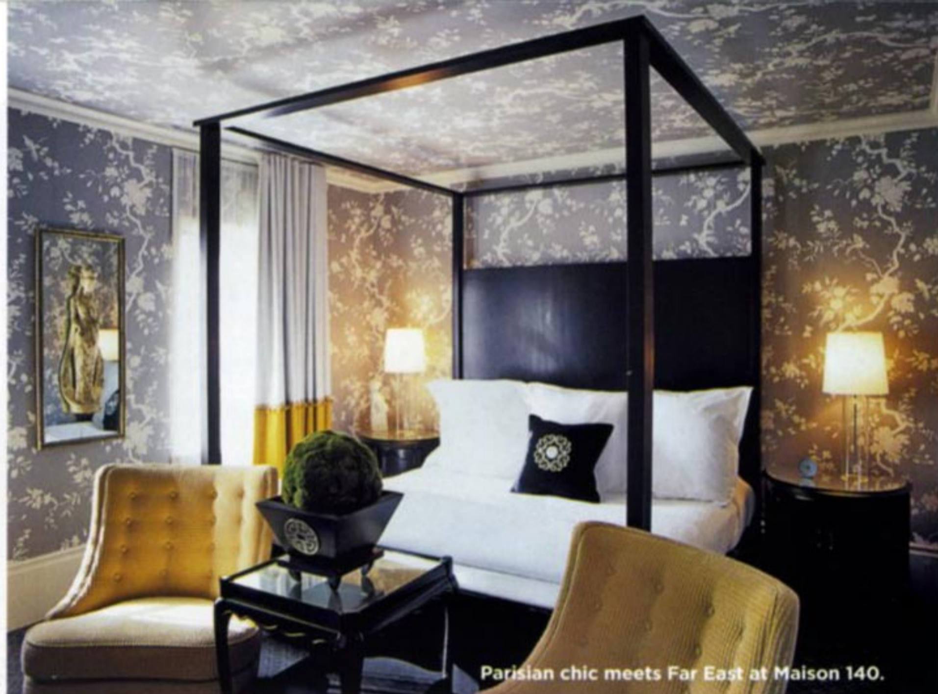
Parisian chic meets Far East at Maison 140.